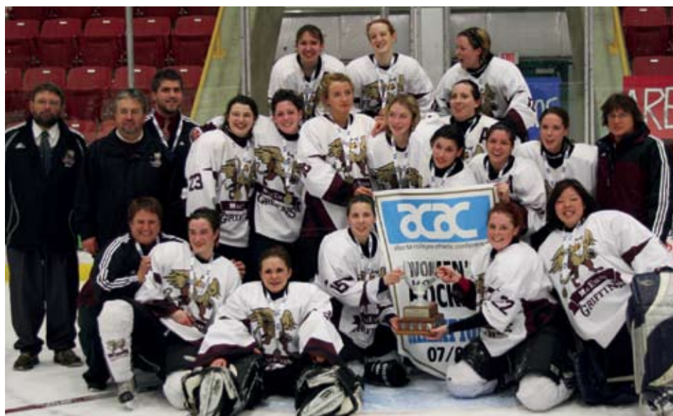
Griffins Women's Hockey team earn gold medal at the ACAC championships.

Griffins Athletics believes in excellence, achievement and balance in academics and athletics. The 2007/08 Griffins proved this balance to be very achievable! Over the academic year, 60 student athletes earned a very good academic standing with 3.0 GPA or higher. 35 received honors standing with the college, receiving a 3.3 GPA or higher, and seven earned excellent standing with a 3.7 GPA or higher.